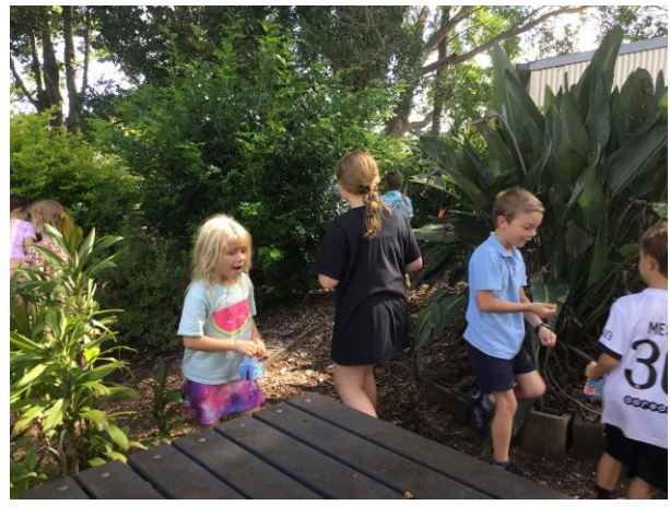
\hbox{\it 5-The Easter Bunny came during our assembly and left little surprises for all our students.}