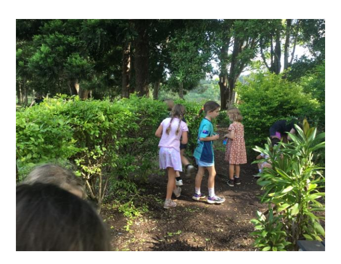
6 - Still searching for eggs!