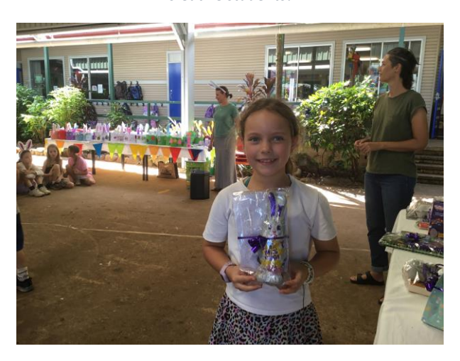
3 - Easter Raffle Prizes! Thank you to all our families for their donations.