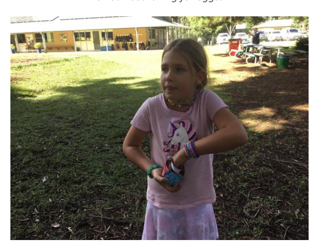
7 - Found some eggs!