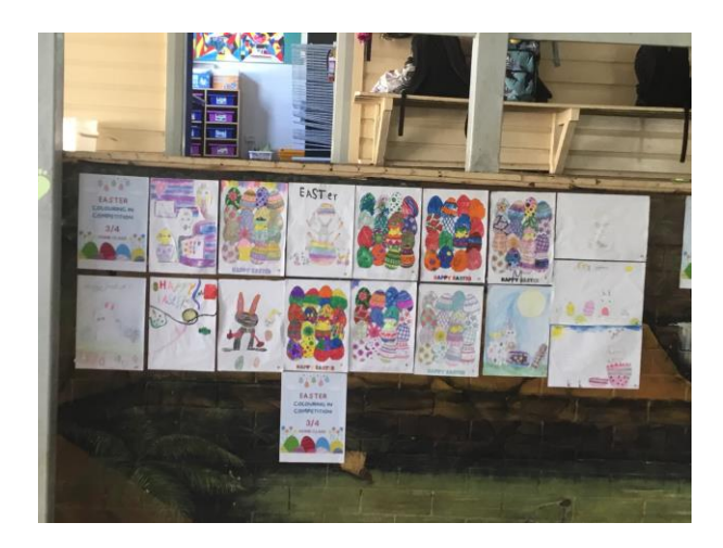
4 - Student Representative Council Colouring In Competition