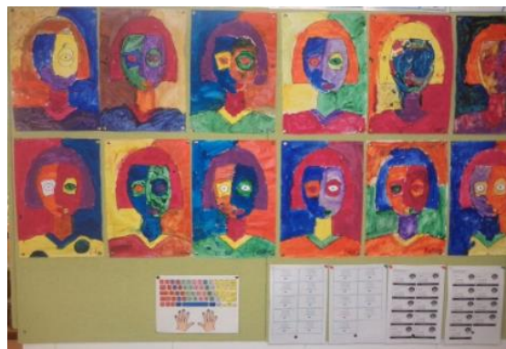
Student display from Creative Art rotation with Ms Azzopardi.