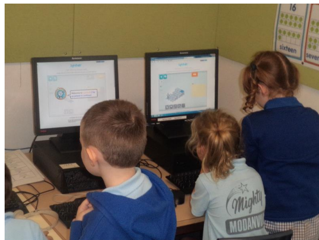
Student coding during rotations.