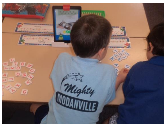
A 'Can Do' activity during L3 literacy sessions is the OSMO literacy activity.