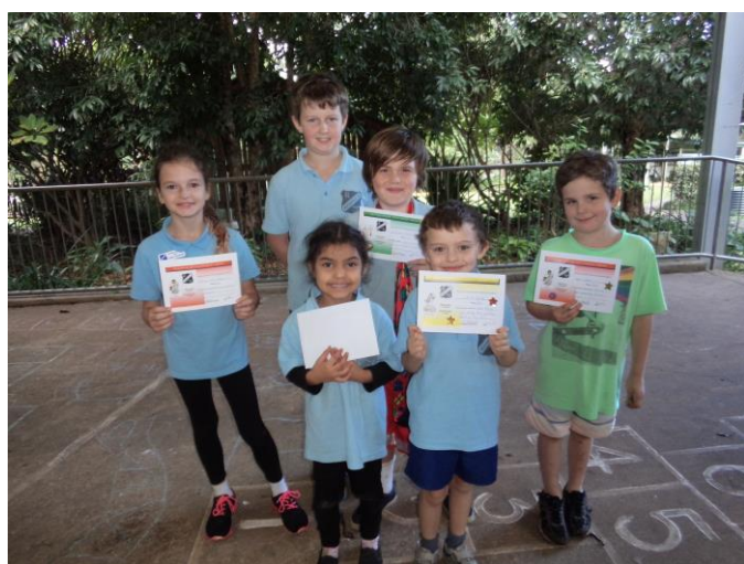
Some work samples from 1/2/3 class