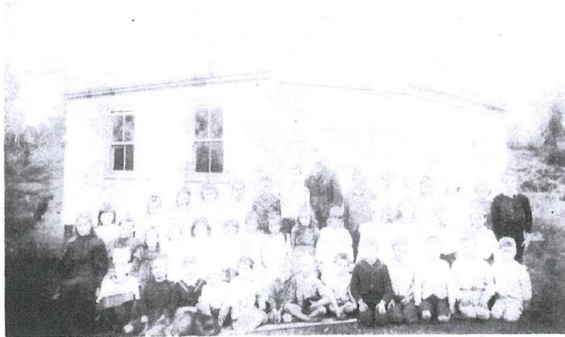
Tullera — Toolaroo — Boerie Public School, 1895.

In approximately 1905 Toolaroo School was burnt down and rebuilt on the same site.