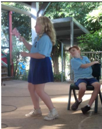
Year 6 Hookey Demonstration