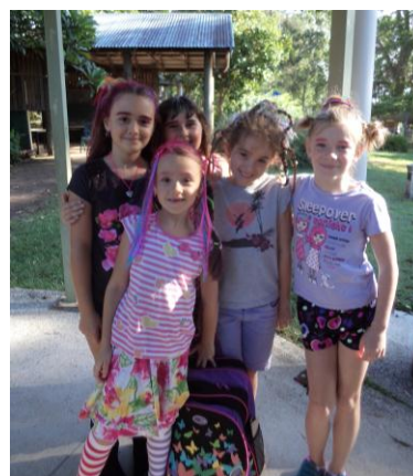
Year 3/4/5 Funky Hair Day Dance: