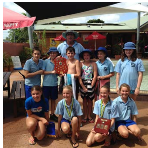
Modanville overall winners of the 2015 District Swimming Carnival