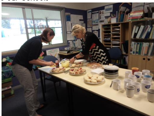
Volunteers preparing afternoon tea

Grandparents are a vital part of our community and it is very rewarding to see so many taking the time to come to our school.