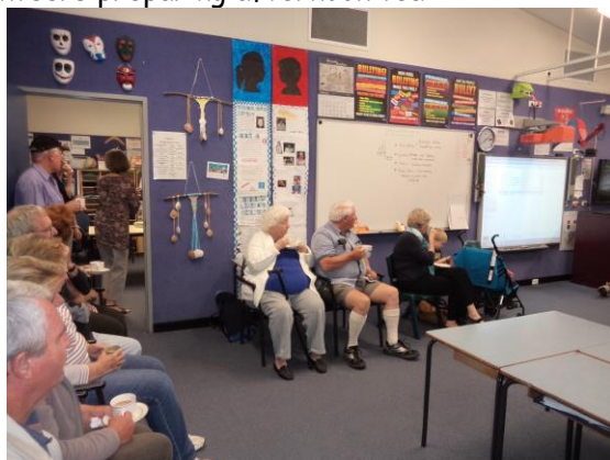
Watching the movies of our talented students