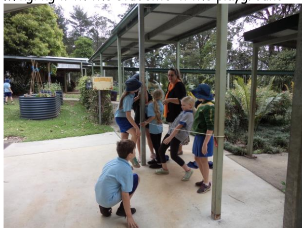
Mingling with the students in the playground